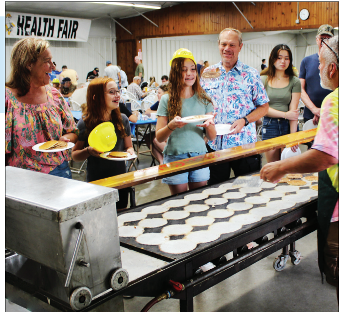
Pictured above, Rock Energy members enjoy a pancake breakfast at the 2023 Rock Energy Cooperative Member Appreciation Day, which was held at the Rock County Fairgrounds on August 5.

Members stopped at our information tables to learn about the importance of calling 8-1-1 before every digging project, natural gas safety, tree trimming, and other insightful items about the co-op.