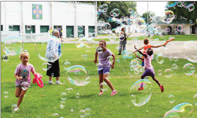
Pictured above, a group of youngsters pop bubbles during the 2023 Member Appreciation Day at the Rock County Fairgrounds.

NOTE: More pictures from the 2023 Member Appreciation Day event will be published in the October magazine.