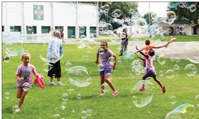
Pictured above, a group of youngsters pop bubbles during the 2023 Member Appreciation Day at the Rock County Fairgrounds.

Members stopped at our information tables to learn about the importance of calling 8-1-1 before every digging project, natural gas safety, tree trimming, and other insightful items about the co-op.