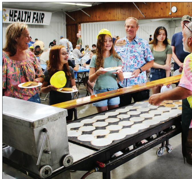
Pictured above, Rock Energy members enjoy a pancake breakfast at the 2023 Rock Energy Cooperative Member Appreciation Day, which was held at the Rock County Fairgrounds on August 5.