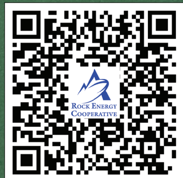
Scan the QR above to view the LIHEAP Income Guidelines.

Where to Apply To apply for assistance, you'll need to complete an application and provide information on each household member and their income, as well as records of your heating costs. For more information and application details, please call your local office: • Winnebago County (South Beloit, Rockton, and Roscoe residents only): 815-389-0914 or 815-624-7788, Rockton Township, 1315 N. Blackhawk Blvd., Rockton. • Boone County : 815-544-3144, United Way of Boone County, 220 W. Locust St., Belvidere. • Stephenson County : 815-232-3141 or 800-883-1111, Northwestern Illinois Community Action Agency, 27 S. State Ave., Freeport. • McHenry County : 815-338-7752, McHenry County Housing Authority, 1108 N. Seminary Ave., Woodstock.