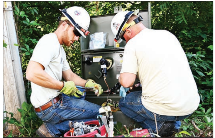
Above, Rock Energy workers access a padmount transformer at a residential home in one of the co-op's service areas.

Why would Rock Energy need to work on your property? Here are some reasons why: