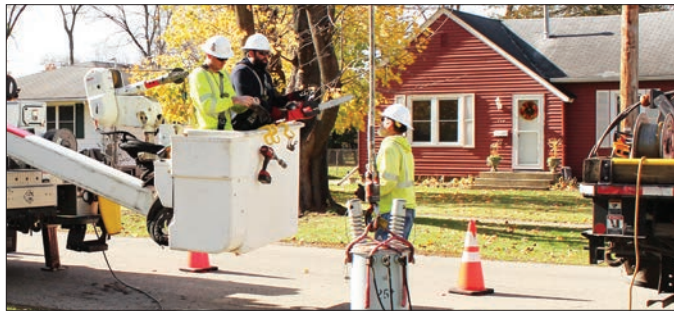
Pictured here, electric line work is conducted by a Rock Energy crew on a member's property.

Rock Energy understands that some of our members prefer to lock entrances to their properties. Those members can grant the co-op access with a gate code or by having Rock Energy add a co-op lock to their chain.