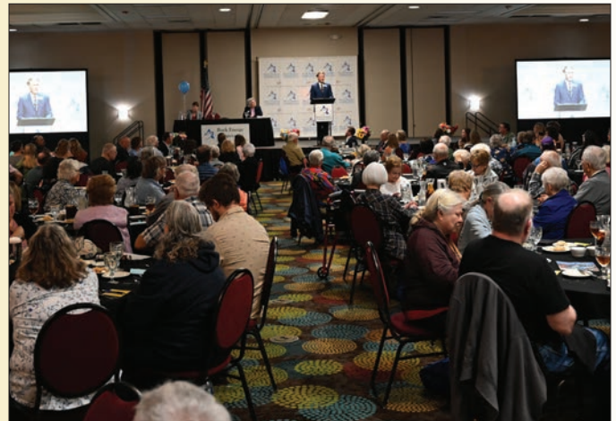
Pictured above, co-op members listen in during the CEO's address at the 2026 Rock Energy Annual Meeting.

Also announced during the scholarship presentation were second-year scholarship winners. Those students, going into their sophomore year of college next year, were not in attendance.