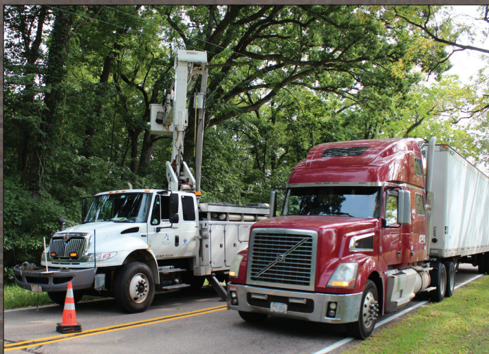
Pictured above, a Rock Energy crew works on a narrow rural road in Southern Wisconsin. In order to perform their duties, one-lane traffic was routed around the work area.