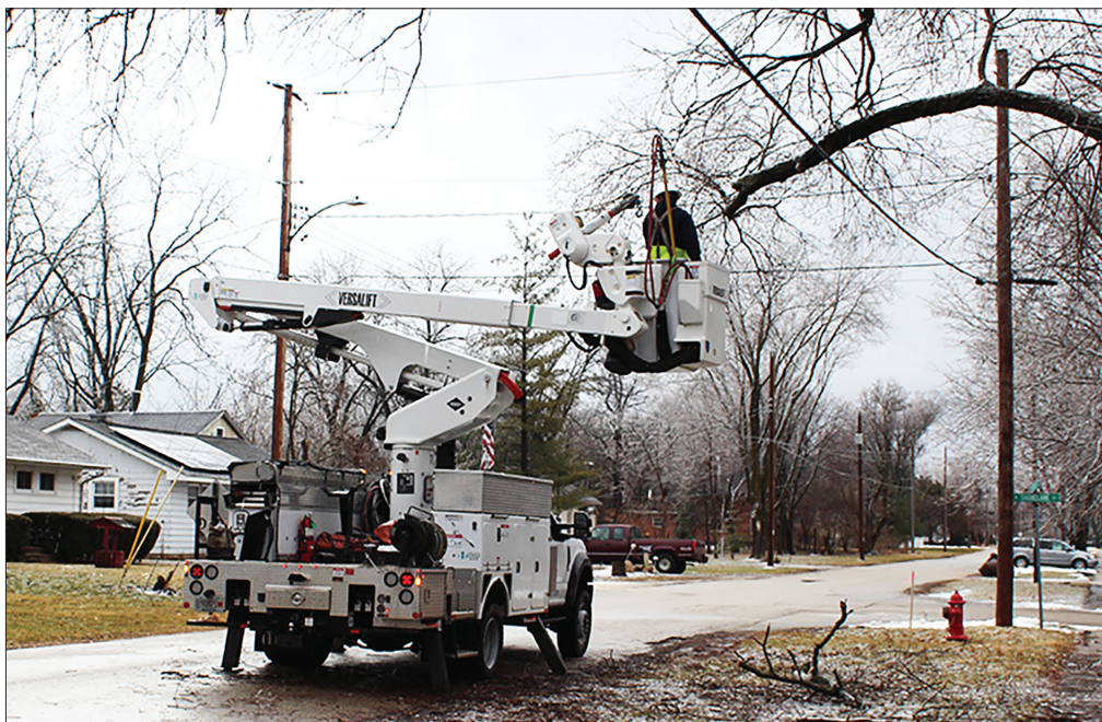
A Rock Energy crew work on getting branches off of power lines. The branches were coated with ice from a storm in February 2023.

So, as winter continues to churn, you may see our line crews on the road as they look out for damage or potential problems with overhead lines. This is part of our normal routine to ensure that our distribution lines are in good working order. If you see our crews on the roadway, please slow down and keep a safe distance while passing them. They are working to keep our electric distribution system safe and reliable.