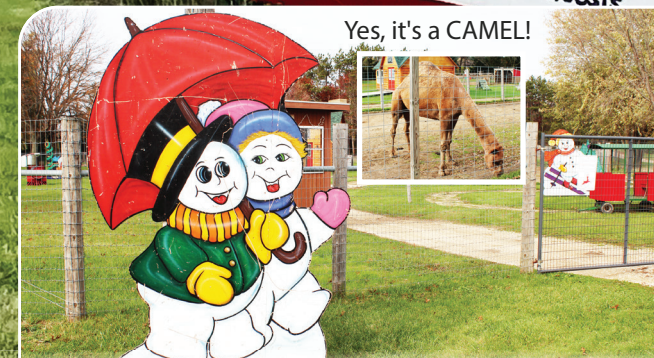
From horse-drawn wagon rides and Santa Claus to hot chocolate and holiday crafts, there are a wide-range of activities and sites to see at Williams Tree Farm.