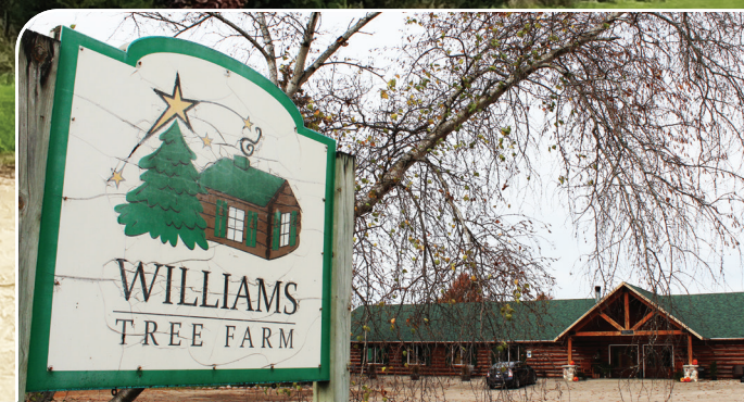
BEFORE THE SNOW FLIES, A VIEW IN EARLY NOVEMBER - Nestled under a radiant sky of vibrant colors and rippling clouds, pictured above/left is a picturesque landscape view of the Williams Tree Farm fields. Pictured above/right is the Williams Tree Farm sign and main building off of Yale Bridge Road that greets visitors at their rural Rockton, IL location.