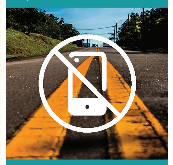
While driving, turn your phone to silent mode, or pull over if the text can't wait.