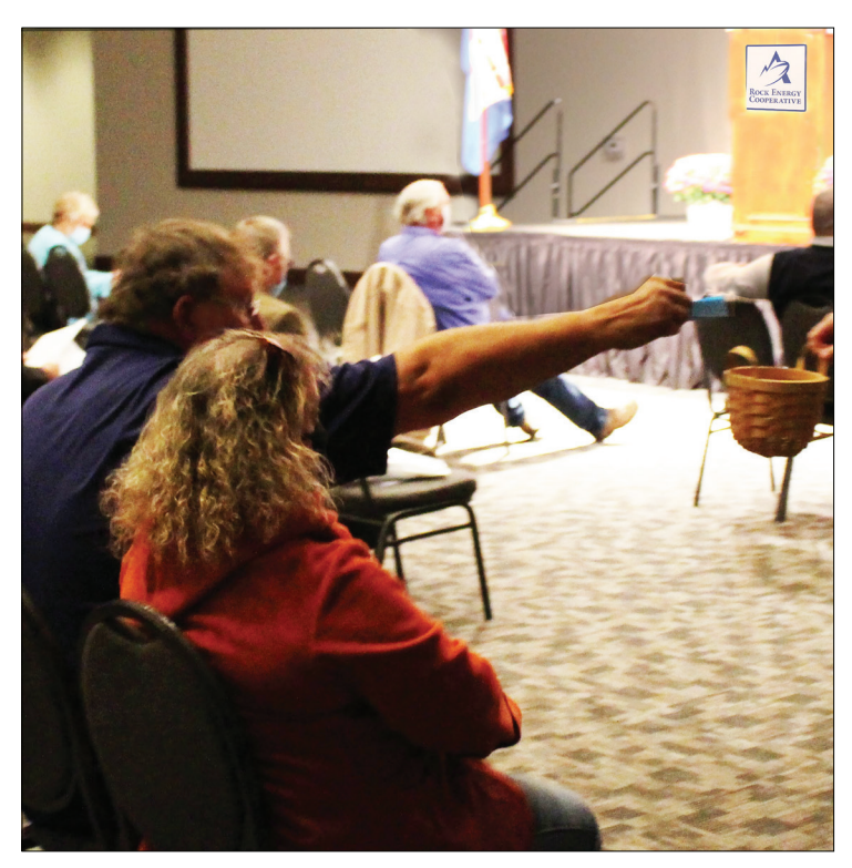
Pictured above, a Rock Energy member casts their ballot at the 2020 Annual Meeting at the Eclipse Center in Beloit, WI.

Even though this year's meeting will be a "business only" event, by virtue of paying your electric bill each month, you're a member of the co-op, and every member has an opportunity to vote when it comes to co-op governance. This ties back to our guiding principles of equitable economic participation and democratic control of the co-op, and it's exactly why we hope to see you at this year's Annual Meeting in September.