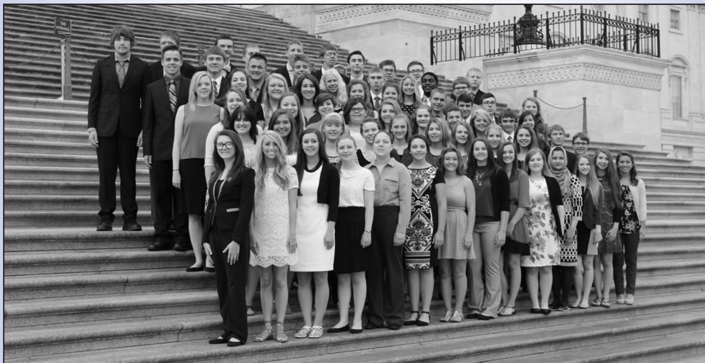
Three students represented Rock Energy on the 2016 Youth Tour, traveling with a group of students from Illinois.