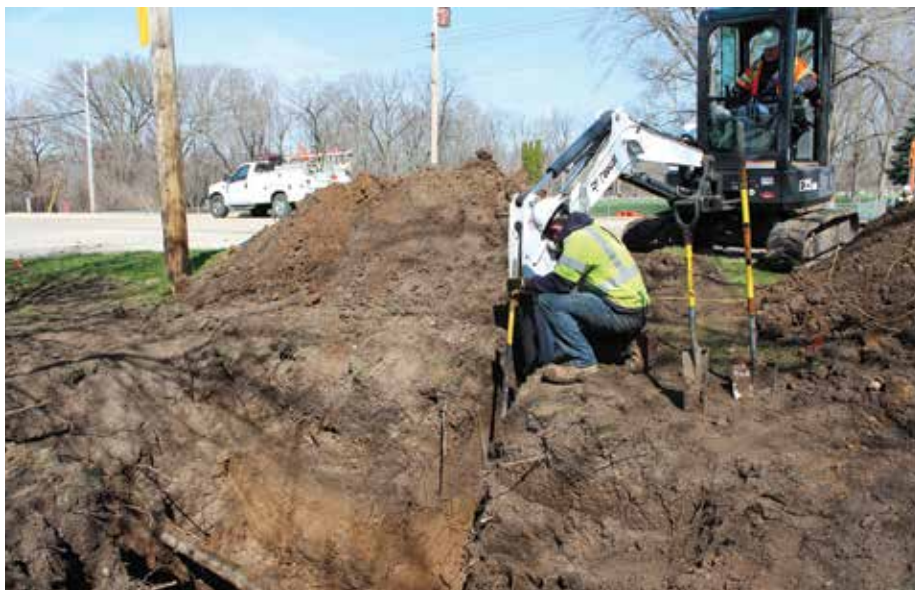
The natural gas crew replaces distribution pipe in Rockton to improve reliability and ensure safety.