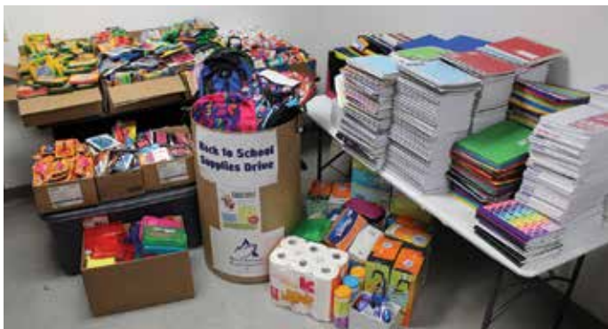
The annual Back-to-School Supplies Drive provides essential items to less fortunate students in 15 area school districts.

meeting will mark the first time since 1962 that the board of directors is without a member of the Nelson family.