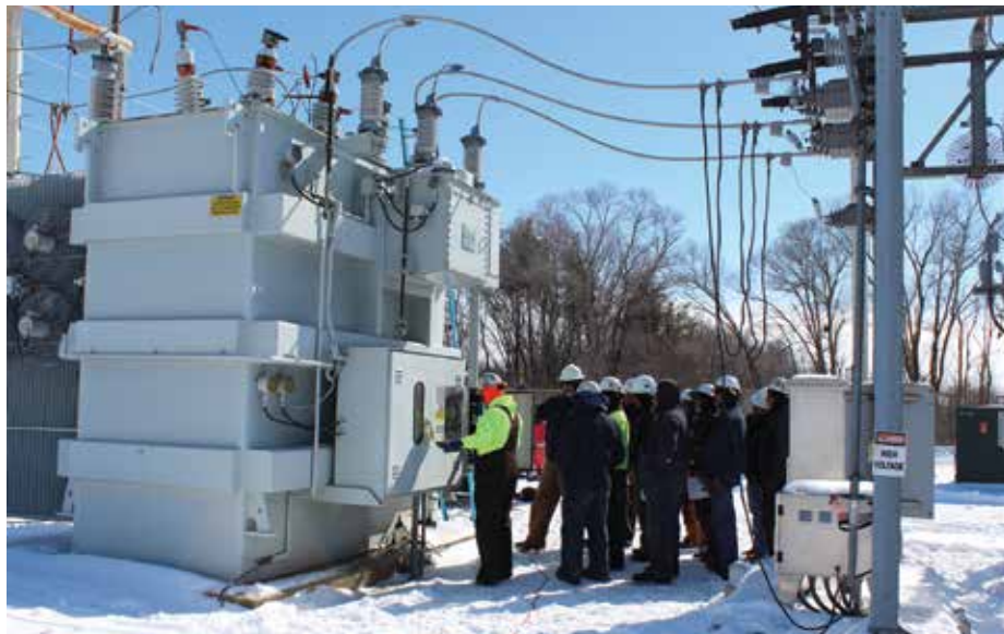
Regular maintenance keeps the electricity flowing. Here, line workers learn the steps required to re-energize the Shirland Substation.

As a cooperative, we operate on a not-for-profit basis. That means we're