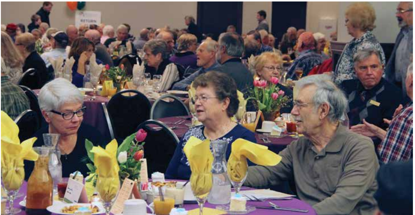
Rock Energy's annual meeting gives members a chance to spend time with friends and neighbors.