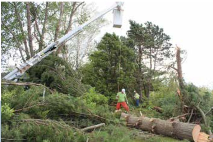
Left: Rock Energy crews clean up storm debris on May 17 after an evergreen tree knocked down power lines on West Creedy Road, north of Beloit. Branches and limbs from the massive tree buried the pole and wires and had to be removed before power could be restored. Below: Straight-line winds gusting to 60 mph tipped over this irrigator on a farm south of Avalon Road. The storm damaged a total of 17 irrigators in Rock Energy's service territory.