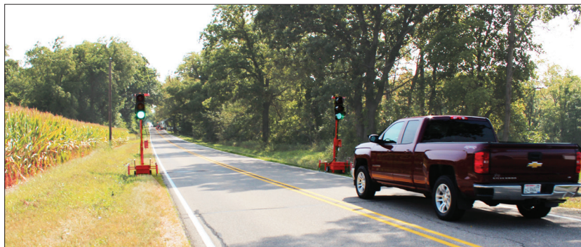
Pictured above is a Rock Energy work zone along Highway 67 in Clinton, WI. New portable stop lights at the work zone sense incoming vehicles from both directions and automatically change accordingly, allowing for vehicles to pass through the one-lane work zone safely.