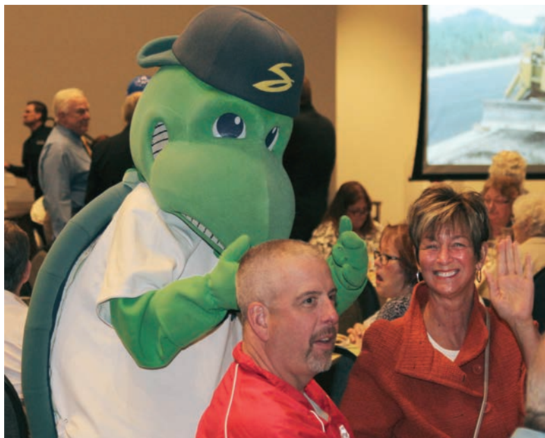
Clockwise, starting from left: Snappy, the Beloit Snappers mascot, mingles with the crowd to promote Rock Energy's Night at the Ballpark on Saturday, June 10.