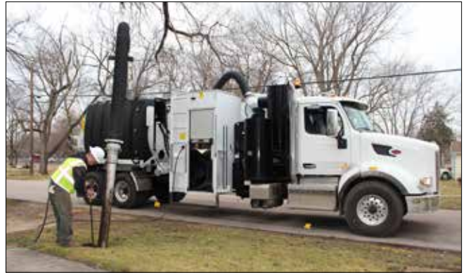
J&R Underground is working with Rock Energy on the projects. Its vacuum excavation truck is used to locate existing facilities. This work must be done before the upgrade begins.