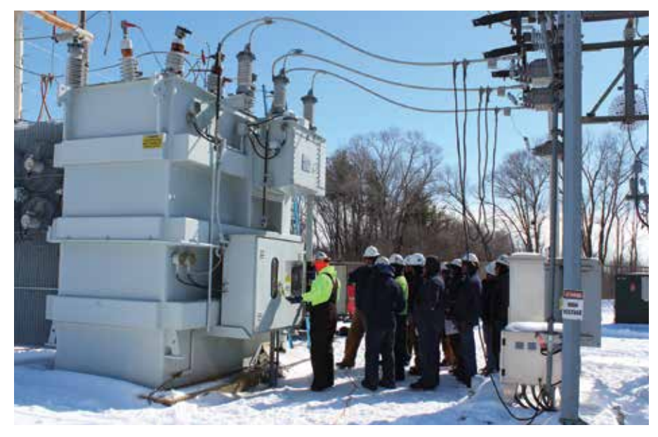
Regular maintenance keeps the electricity flowing. Here, line workers learn the steps required to re-energize the Shirland Substation.

As a cooperative, we operate on a not-for-profit basis. That means we're