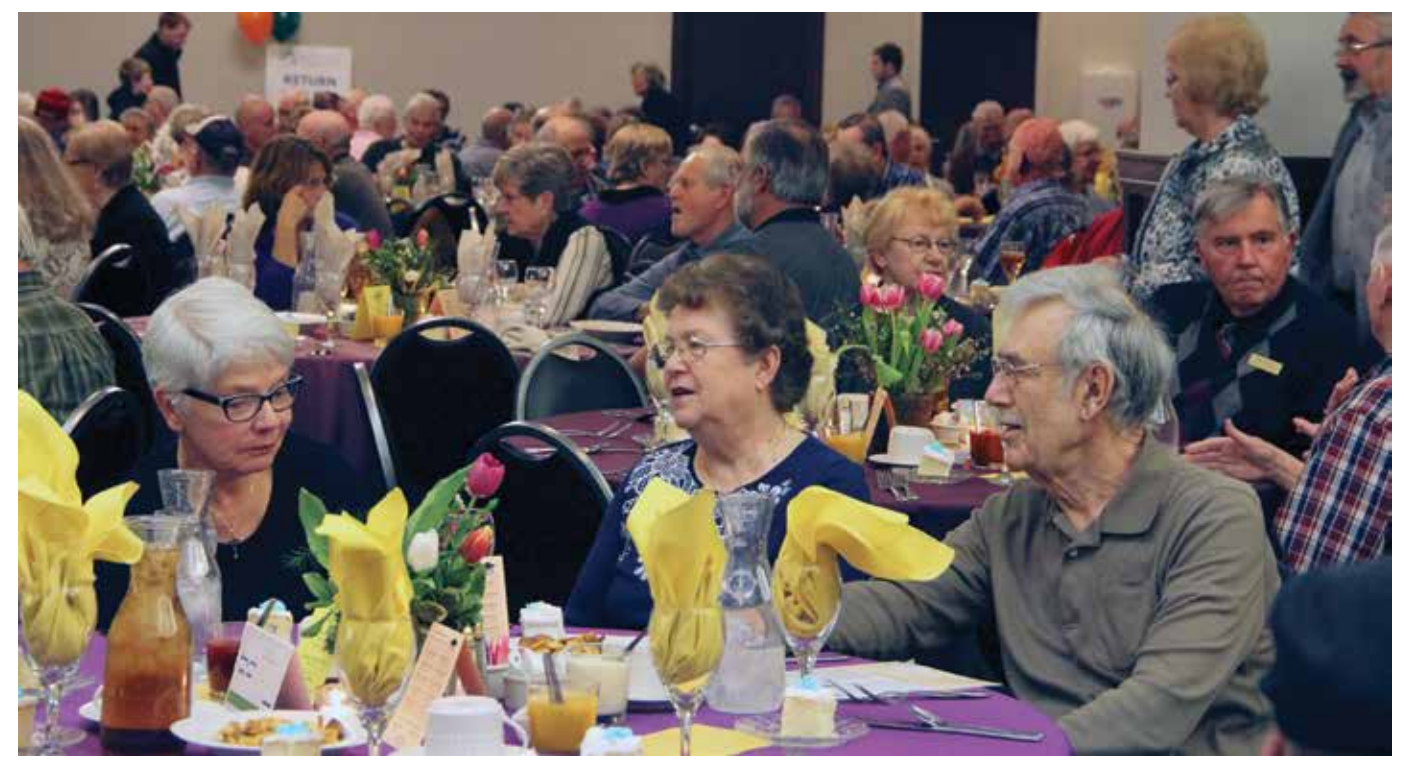
Rock Energy's annual meeting gives members a chance to spend time with friends and neighbors.