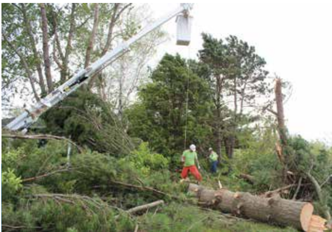
Left: Rock Energy crews clean up storm debris on May 17 after an evergreen tree knocked down power lines on West Creedy Road, north of Beloit. Branches and limbs from the massive tree buried the pole and wires and had to be removed before power could be restored. Below: Straight-line winds gusting to 60 mph tipped over this irrigator on a farm south of Avalon Road. The storm damaged a total of 17 irrigators in Rock Energy's service territory.