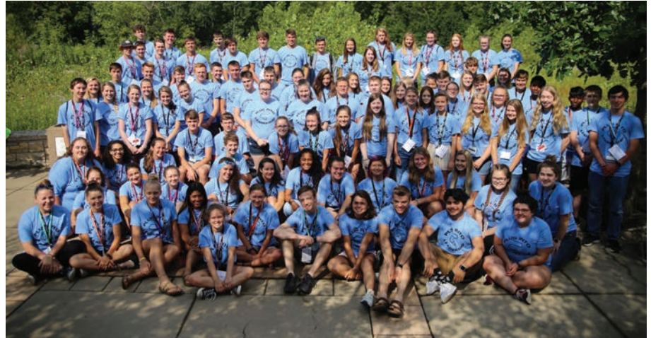
Students participating in the 2019 Youth Leadership Congress at UW-River Falls learned about the value of cooperation.