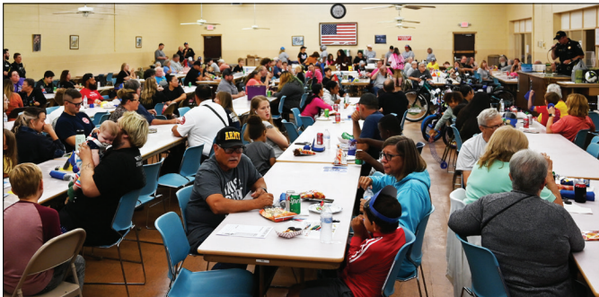
Above, Night Out event attendees enjoy free food and refreshments. Below, the South Beloit Police Department talk to attendees at their table.