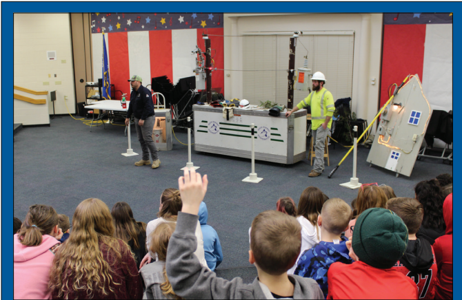
"Hot Line Demo" presented to students at Milton Northside.

2023 was a very busy and eventful year for Rock Energy Cooperative and its members! Here is a quick pictorial review of some of the events that took place in 2023.