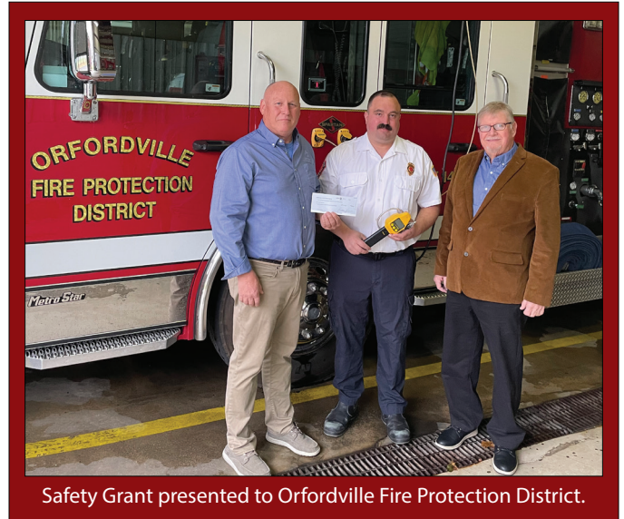
Safety Grant presented to Orfordville Fire Protection District.