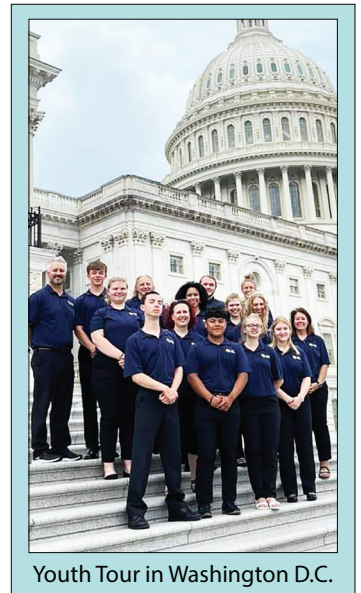
Youth Tour in Washington D.C.