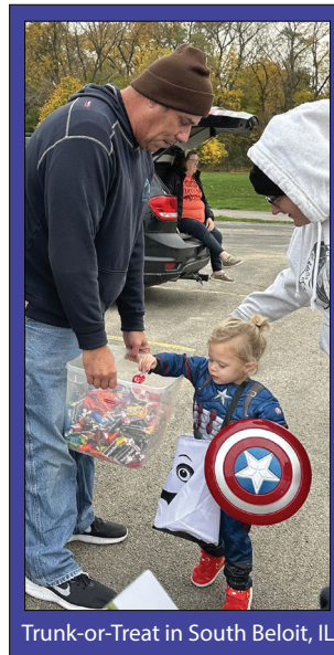
Trunk-or-Treat in South Beloit, IL