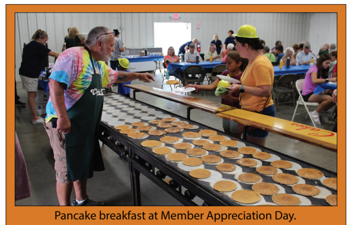
Pancake breakfast at Member Appreciation Day.