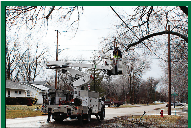
A major ice storm hits the area - Rock Energy crews respond.