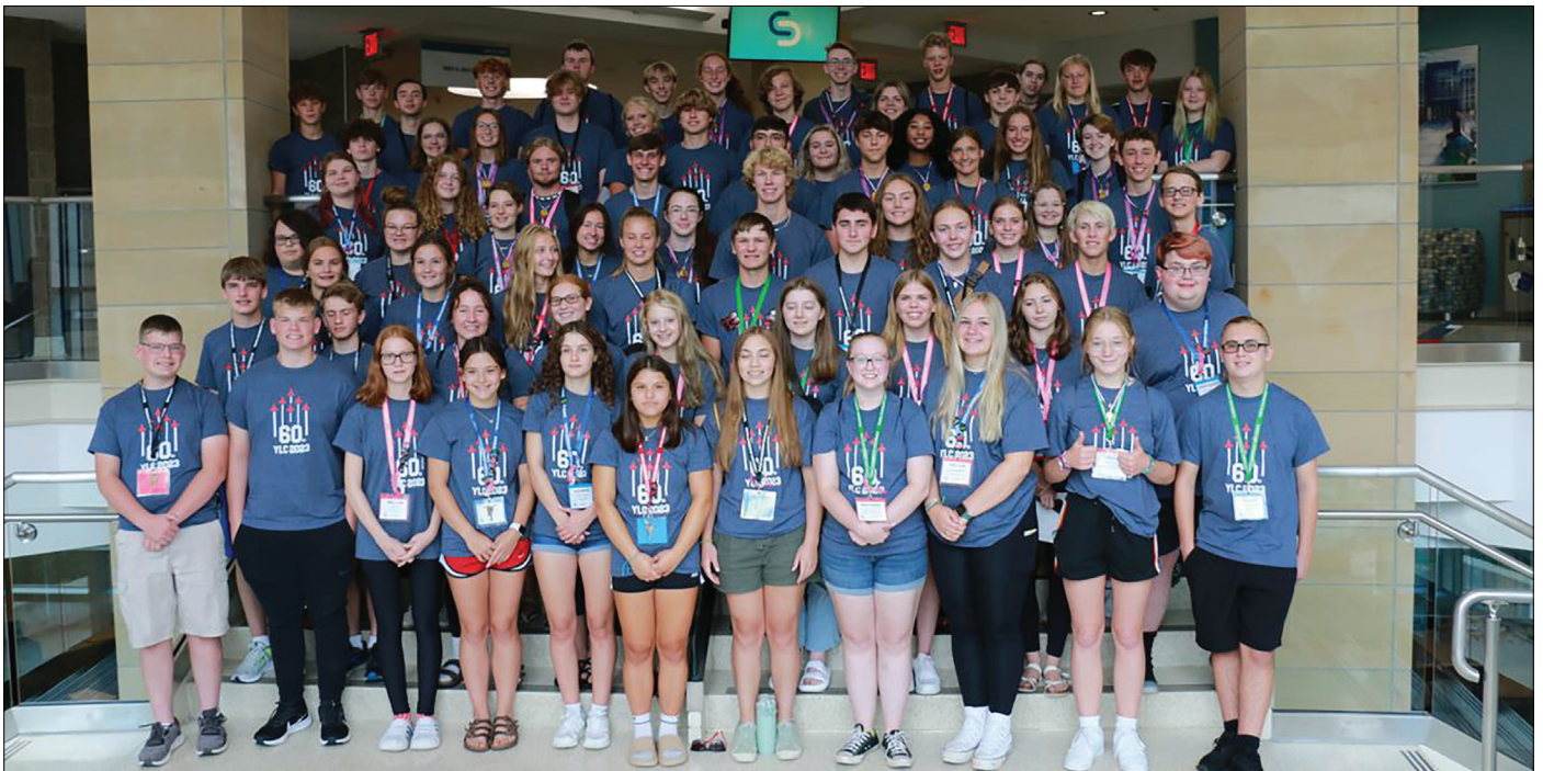
Pictured above are the participants at the 2023 YLC event, representing 15 different cooperatives. The 2023 event took place at UW-Stout in Menomonie, WI, which is where it will be held again this year.