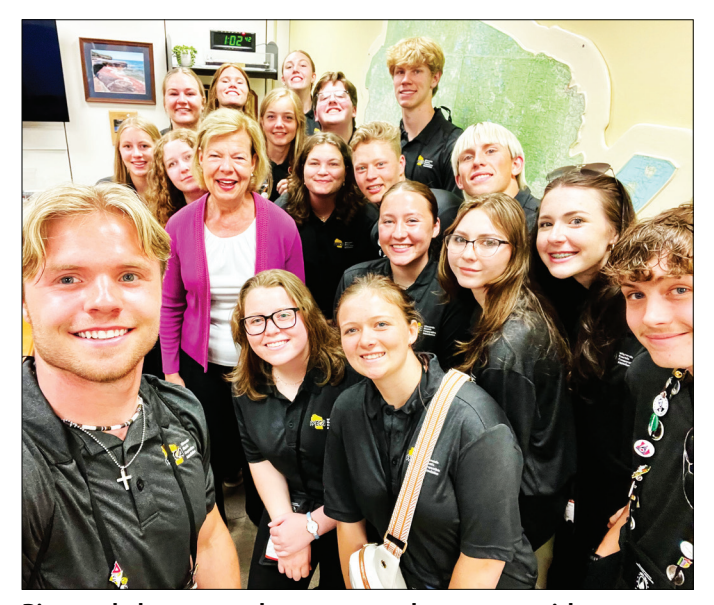
Pictured above, youth co-op members meet with legislative staff and legislators, including Senator Tammy Baldwin (D-Wisconsin) (wearing purple sweater), at the White House during the 2024 Youth Tour.