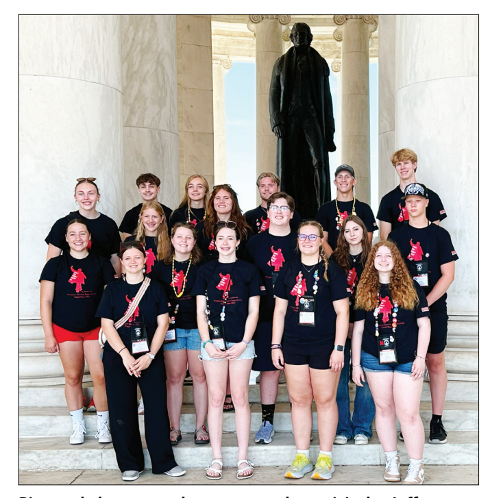
Pictured above, youth co-op members visit the Jefferson Memorial in Washington D.C.

For more details about the Youth Tour, go to www.rock.coop, navigate to the Community & Youth tab, and click on Youth Tour.