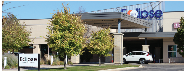
REC's 86th Annual Meeting will take place on Sept. 19, 2022, at the Eclipse Center in Beloit, WI (pictured above).