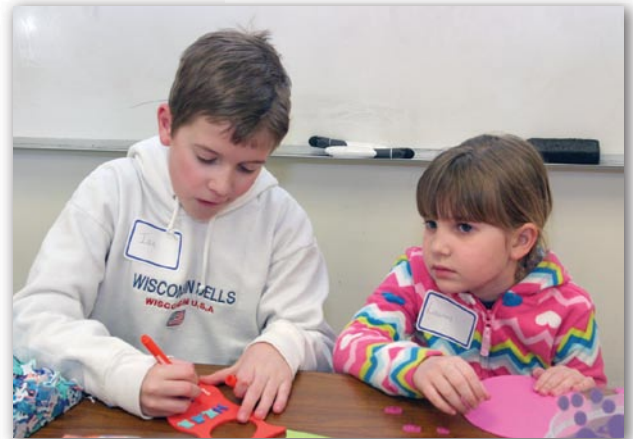
Children work on crafts while their parents attend the meeting.