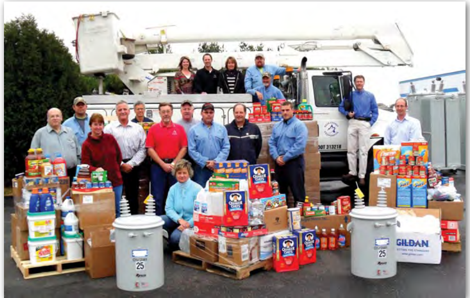
Rock Energy Cooperative employees show the 6,023 pounds of groceries they collected during the “Transforming People’s Lives” project. The donated items equal the weight of 30 pole-top transformers like the two in the photo.

The co-op’s 55 employees at its Janesville and South Beloit locations divided into two groups—Team Kilowatt and Team Voltage—to see which team could collect the most groceries—measured in pounds. Each pole-top transformer used on co-op lines weighs about 200 pounds, and