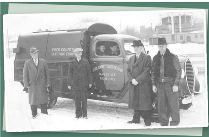
This photo, taken in the early 1950s, shows co-op representatives with a brand new vehicle. At the time, this utility vehicle was considered state-of-the-art.

One principle that sets co-ops apart is our concern for community. As a cooperative, we have a special responsibility to support the areas in which our members live and work. From sponsoring high school scholarships to providing the reliable electrical service needed to sup-