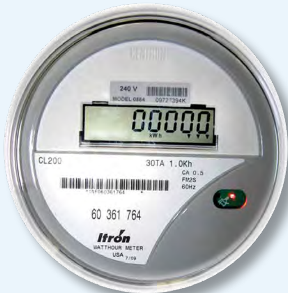
Solid-state electronic meter