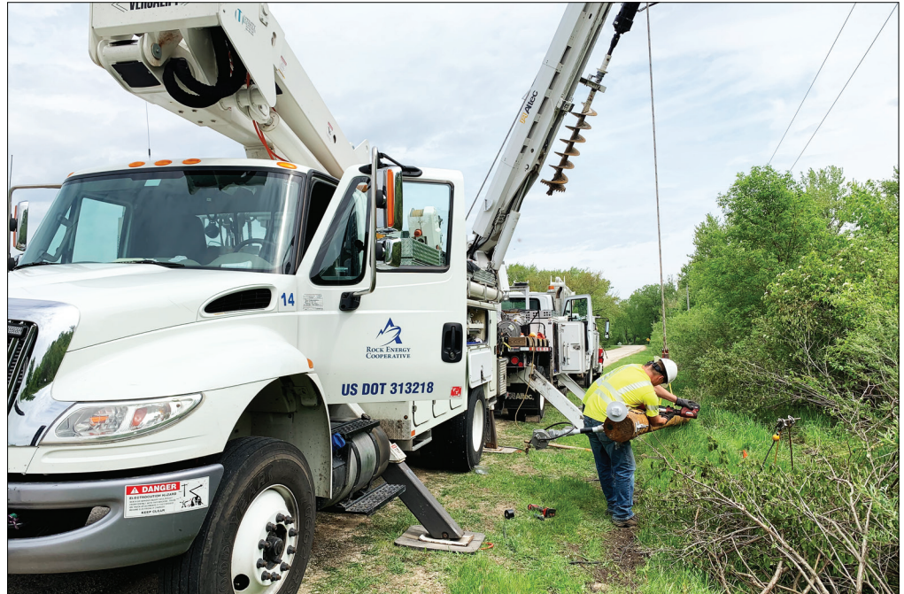
Rock Energy works diligently on line maintenance throughout the year. Pictured above, a Rock Energy crew works on a pole replacement project on Clover Road in Rockton, IL, in the spring of 2021.

In order to continue to provide reliable service, in 2021 Rock Energy dedicated a significant amount of resources for tree trimming and line maintenance. Tree trimmers traverse our 1,200 miles of line to remove tree branches and other