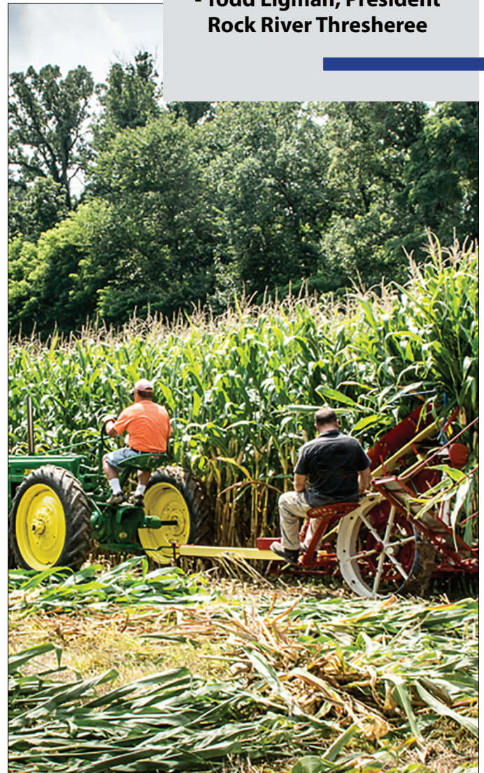
Pictured here is one of the many demonstrations from the 2019 Thresheree.