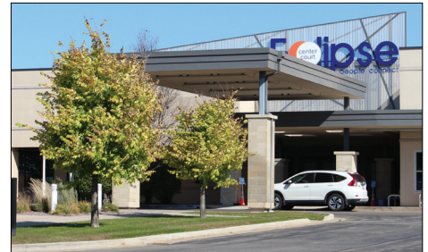
Eclipse Center, Beloit, WI

The Rock Energy Cooperative 85th Annual Meeting has been scheduled to take place on Monday, Sept. 27, 2021, at the Eclipse Center in Beloit, WI. However, please note that the event date is subject to change pending any unforeseen COVID-related mandates.