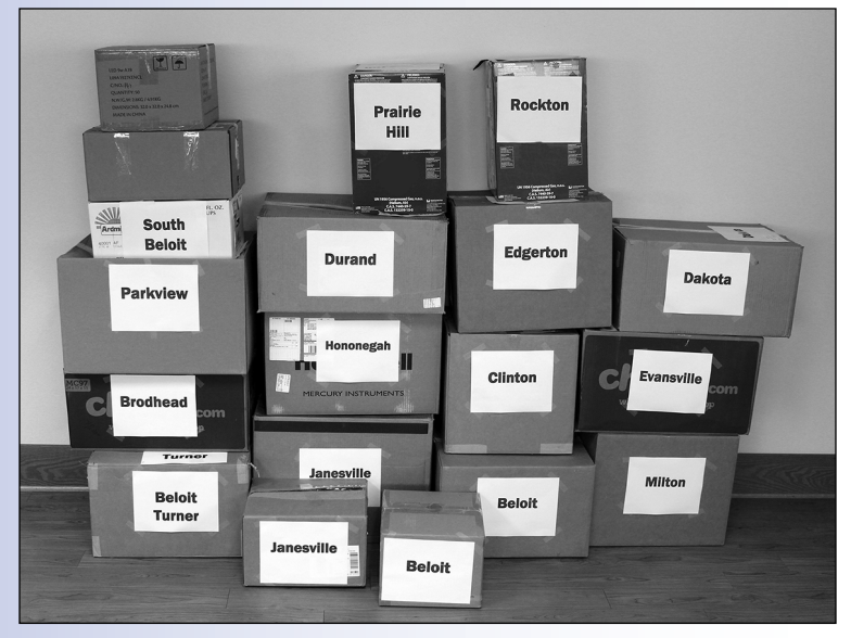
Rock Energy Cooperative members and employees donated thousands of back-to-school items during the co-op's School Supplies Drive in July. The donations were packed into boxes and delivered to 15 area school districts so less fortunate students could start the new school year off right.