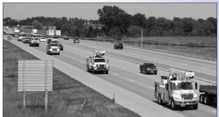
Line crews from Wisconsin co-ops met at Rock Energy headquarters in Janesville before heading south to Florida.