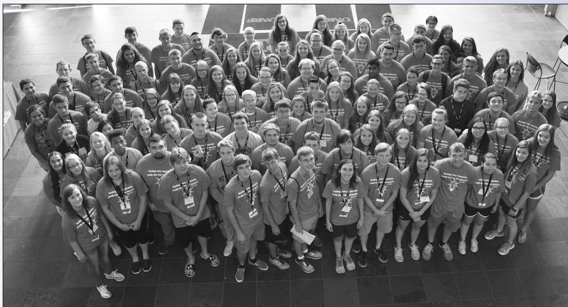
Students attending the 2017 Youth Leadership Congress learned about the value of cooperation.

• See what makes the cooperative business model different and successful and apply this knowledge to fun and challenging cooperative activities.