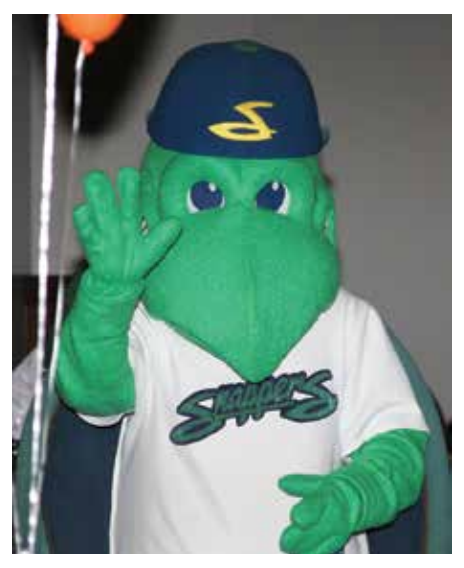
Snappy, the Beloit Snappers mascot, made an appearance before the meeting to promote Rock Energy's Night at the Ballpark on Saturday, June 22.

The new system is fast, accurate, expandable, and extremely secure from a cyber standpoint. We now receive readings on all meters every 15 minutes, which amounts to almost 2 million meter readings every day. With all that