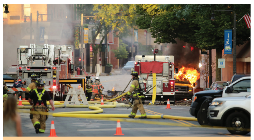
Sun Prairie first responders work quickly to evacuate the area after a natural gas pipe was hit on July 10.

"Natural gas is one of the safest and most reliable forms of energy, but it's also something to be cautious of," Gant said. "By understanding the potential dangers and working together to deal with them correctly, everyone can feel safer."