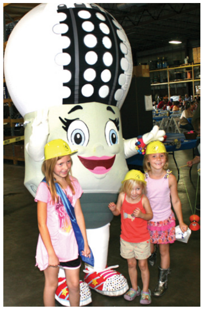
LED Lucy is always a hit with the young ones, who had loads of fun with balloon creatures, painted faces, and energy props. More photos are on page 20C.

Members stopped at our information tables to learn about