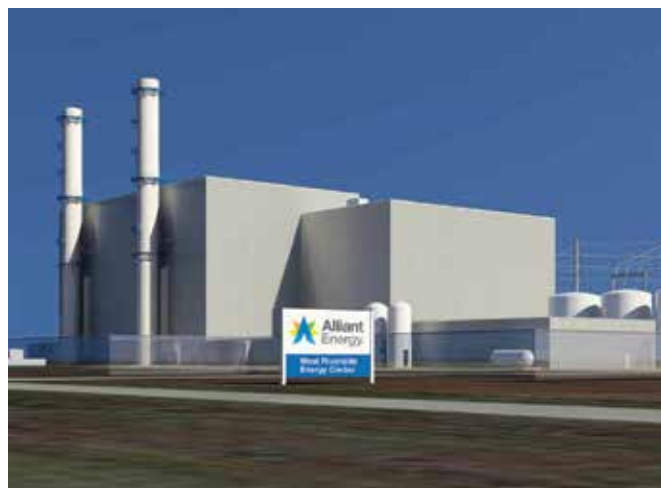
This artist’s rendering shows how the new West Riverside Energy Center will look when it is completed in 2020. Rock Energy is a partner with Alliant Energy in the new power plant.