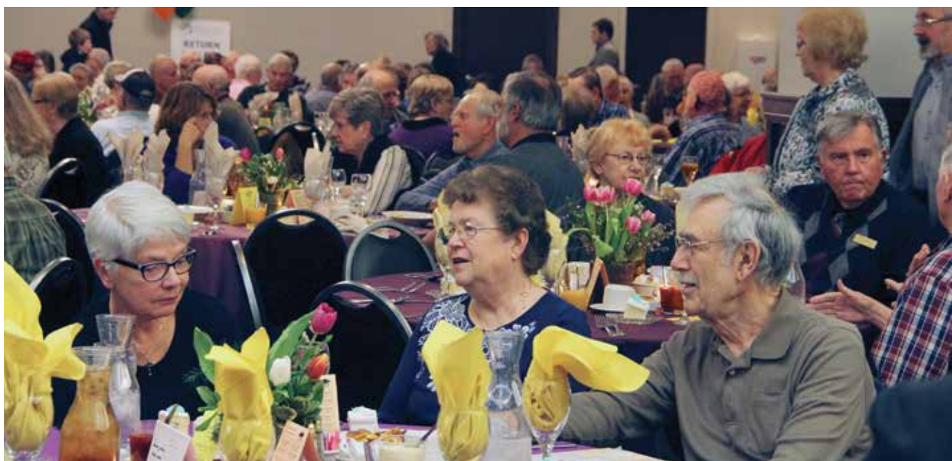
Rock Energy's annual meeting gives members a chance to spend time with friends and neighbors.

Our back-to-school supplies drive each summer helps less fortunate students in 15 area school districts start the school year off with the tools they need to succeed. Ten deserving high school students receive college scholarships each year. Since 1989, Rock Energy has awarded more than $97,000 in financial aid to deserving students. Our youth programs help build strong citizens by supporting the youngest members of our co-op family, not only to enrich their ▶