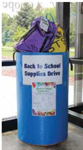
The annual Back-to-School Supplies Drive provides essential items to less fortunate students in 15 area school districts.

As a cooperative, we have a responsibility to support the communities we call home. From sponsoring high school scholarships to providing reliable energy needed to support business and industry, we are a driving force in the communities we serve. We support policies and promote projects that are good for the areas we serve because what's good for the communities is good for the co-op.