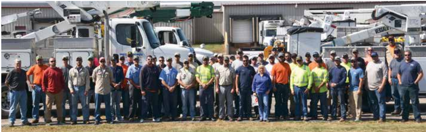
Crews from 18 Wisconsin co-ops traveled to northern Florida on a relief mission to help restore power after Hurricane Irma.