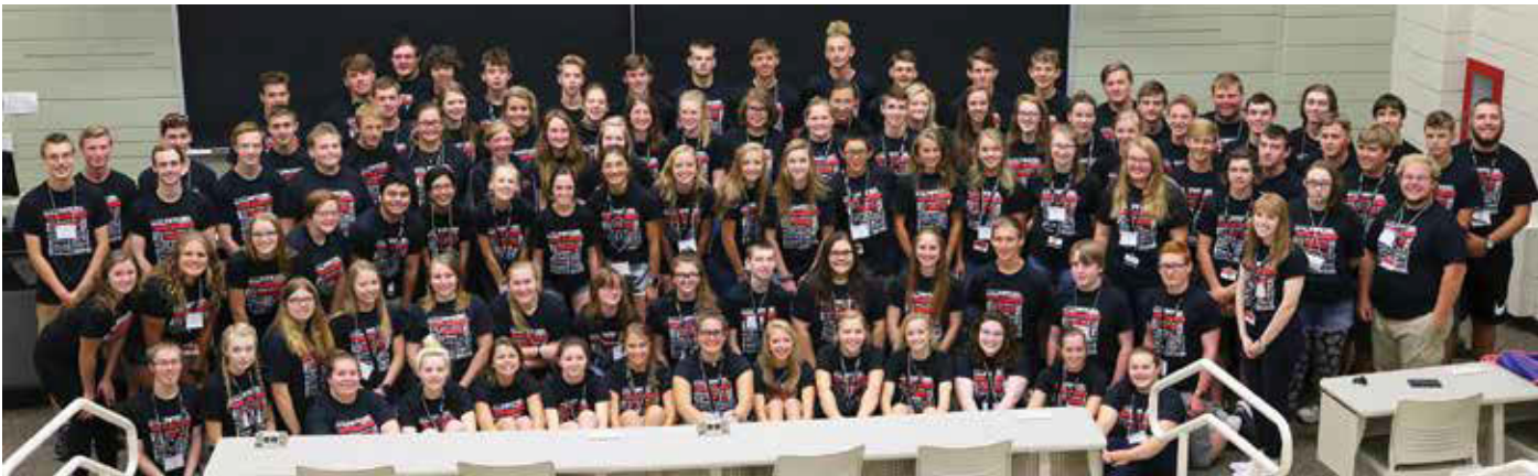
Students participating in the 2018 Youth Leadership Congress at UW-River Falls learned about the value of cooperation.